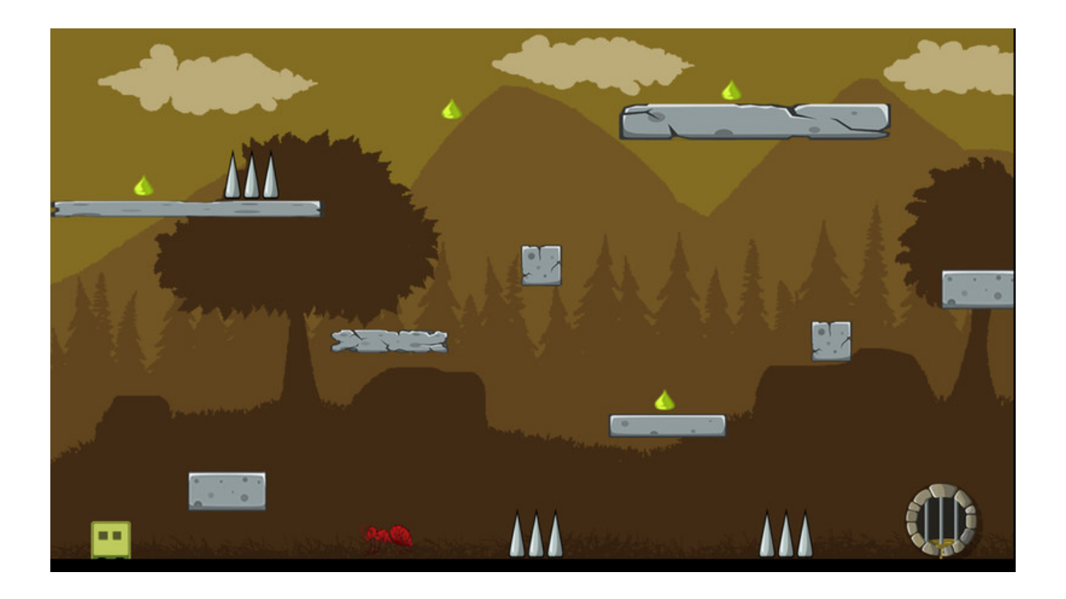
The Slug Ativador Download [FULL]

Download ->->-> <a href="http://bit.ly/2SPjcSi">http://bit.ly/2SPjcSi</a>